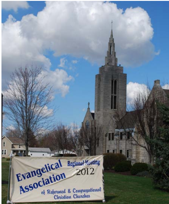
St. John's Christian Church in Archbold, Ohio